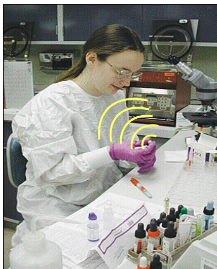
External Radiation risk

Depending upon the quantity and isotope, unsealed radioactive material can emit significant levels of radiation, causing exposure of those who work with it or are in the vicinity. This is known as external radiation. In addition, unsealed radioactive material might enter the body by skin absorption, inhalation or ingestion. This is known as internal radiation. Radioactive material inside the body will irradiate tissue at high levels since it is in such close contact with the tissue. It is also very much more difficult to remove. The dose can vary enormously depending upon the chemical behaviour of the radioisotope in the body.