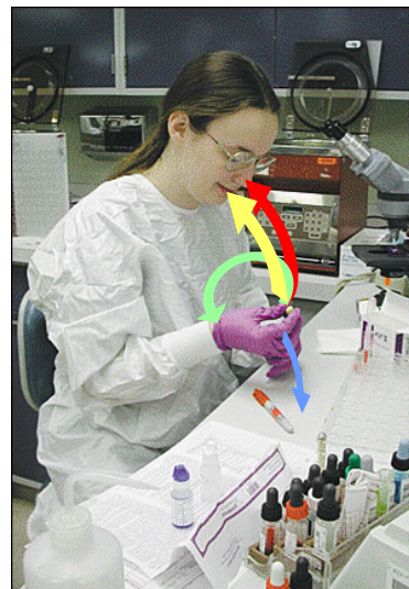
Internal Radiation risk

Work with unsealed radioactive material always requires control measures to reduce the risk of radioactive material getting on or in the body. This is known as contamination control. In addition, some radionuclides might present an external radiation risk and precautions will be needed against this.