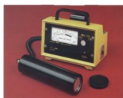
Mini 900 44A

Readings from contamination meters are normally given in “counts per second (c.p.s.)” or “disintegrations per second (d.p.s.)” 1 . This is because the response of the instrument to surface radioactivity varies with the radionuclide being measured. However, some contamination meters have standard conversion factors programmed into the instrument’s signal processing circuits, thus giving the user the option of reading in surface contamination units of becquerels per square centimetre of surface (Bq cm -2 ), having selected the particular isotope. Some typical contamination meters are shown below: