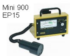
Mini 900 EP15