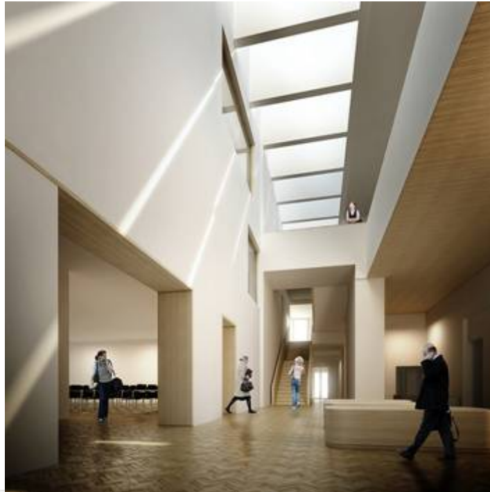
View of new Social Space