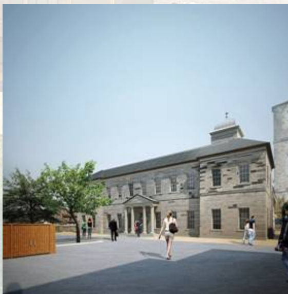
View to ECCC main entrance

The design of the landscape areas is being developed by MFA in conjunction with an Ecologist to maximise the potential for extending the biodiversity of the site.