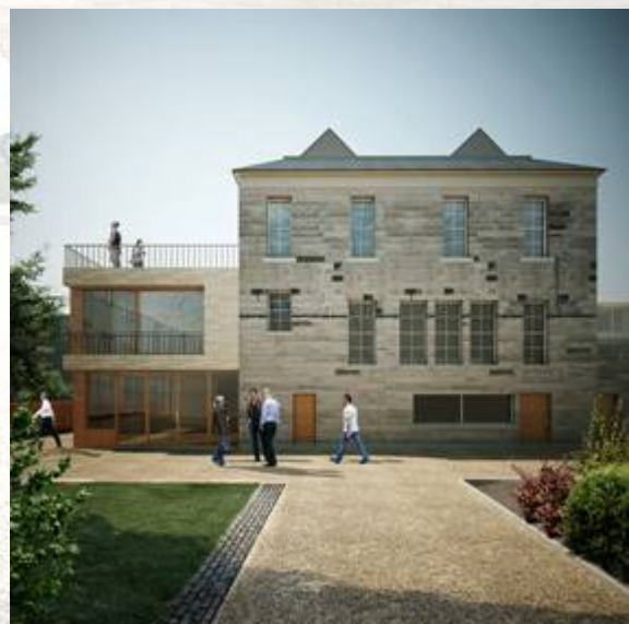
View from Surgeon's Square